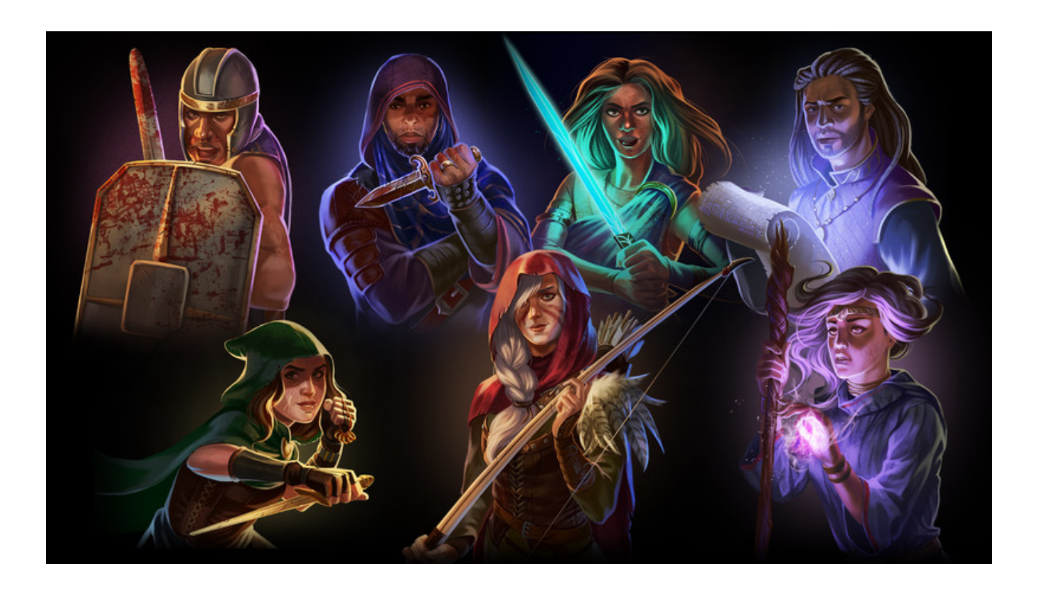
Tyranny - Portrait Pack Download Utorrent Windows 7

Download ->>->> <a href="http://bit.ly/2JnBG9p">http://bit.ly/2JnBG9p</a>